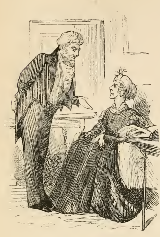
CHAPTER XIX. AN UNWELCOME VISIT.

"The worse luck mine," muttered he, as he closed the window and leaned his head on his band.